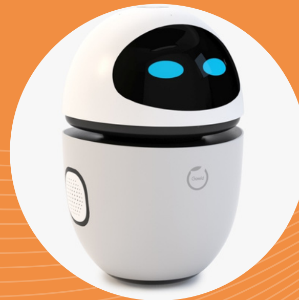
3D Electronic & Gadgets Rendering