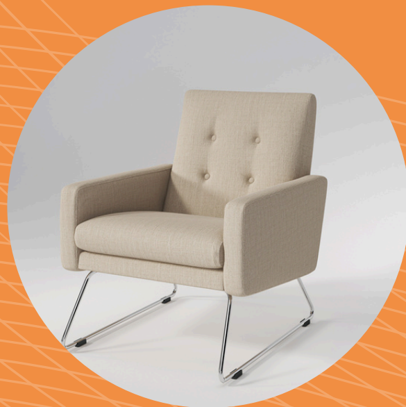
3D Furniture Rendering

We Serve Various Industries to Boost sales with our Specialized 3D rendering service