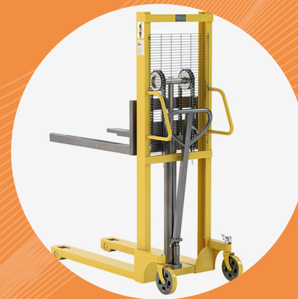
Industrial Product Rendering