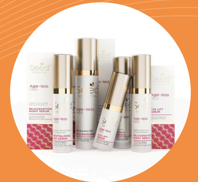
3D Packaging rendering